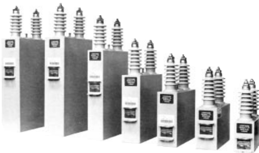
Figure 1. The family of Cooper Power Systems single-phase, all - film capacitors.